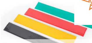
Self-Curing Insulation Waterproof Wrapping Material

Suzhou Woxing Electronic Technology Co., Ltd., founded in October 2006, is a high-tech enterprise dedicated to the research, production, and sales of advanced polymer materials. Its products are widely used in power, communications, automotive, aerospace, rail transit, and electronics industries, providing insulation, sealing, waterproofing, and fire safety solutions. Located in Wuzhong District, Suzhou, the company owns independent intellectual property rights and over 90 patents, certified by IATF16949, UL, ISO, and other authoritative domestic and international organizations. fire-proof.cn