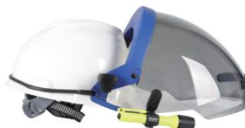
15cal High-Transparency Gray Spherical Anti-Arc Face Shield

Shanghai Chengge Safety Equipment Group Co., Ltd. develops and sells emergency rescue gear, protective clothing, safety tools, and materials, providing one-stop solutions for workers in high-risk environments like fires, explosions, and chemical exposure. * www.chengge.com.cn