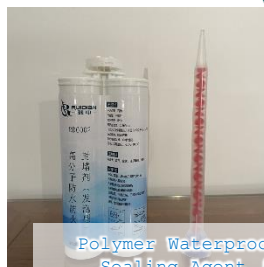
Polymer Waterproof and Fireproof Sealing Agent (Foaming Type)

The company offers fireproof bags, blankets, explosion-proof mats for cable joints, fire-blocking materials, cable fireproof coatings, polymer anti-condensation sealing materials (self-leveling, foaming, spraying, waterproof grouting), fireproof cable trays, and L-shaped composite fireproof boards. It has obtained inspection reports from national fireproof building material and electrical material quality supervision centers, passed three-system certifications, and earned over ten green certifications, including green factory and supply chain • http://fire-proof.cn/