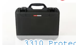
3310 Protective Case

Beijing Bailineng Safety Protection Equipment Co., Ltd is located in Taizhou, Zhejiang, a coastal area with excellent transportation access. The company owns its production facilities, equipped with injection molding machines, cutting machines, and engraving machines, enabling rapid delivery of bulk orders. For years, it has been a long-term supplier to global partners. The factory also features a self-built EVA inner liner production workshop, offering convenient custom liner processing and efficient delivery control. Customization services, such as combination locks, logo printing, and perforations, are available, enhancing packaging while optimizing product presentation.