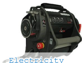
Electricity Inspection UAV

Founded in 2011, Vertical specializes in high-altitude work equipment, emergency rescue gear, training, services, and solutions. It provides professional products and services for industries such as power, clean energy, emergency rescue, offshore wind power, offshore oil, and construction. The company's high-altitude work equipment, rescue gear, personal protective equipment, and fall protection devices feature world-class technology and enjoy a strong reputation globally. www.vertical.cn