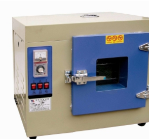
Constant Temperature Drying Box