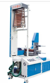
Film Blowing Machine